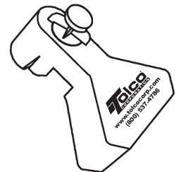
Door Buddy™ Doorstop